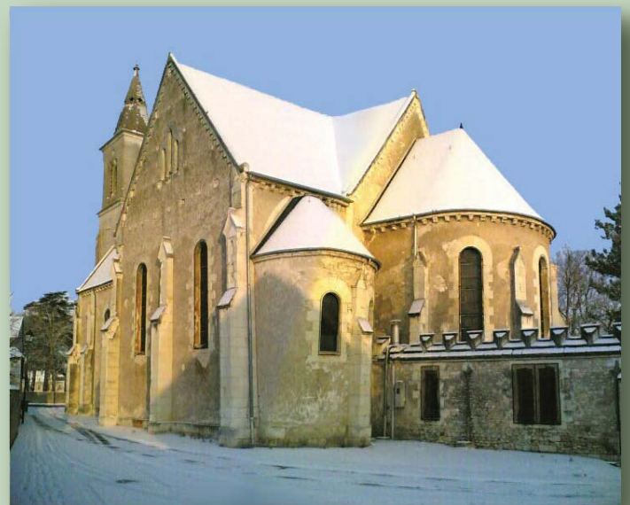
Foëcy Church is stunning in all seasons.